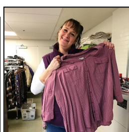
180,798 items of clothing (plus bedding, household items & hygiene products)