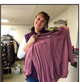
135,113 items of clothing (plus bedding, household items & hygiene products)