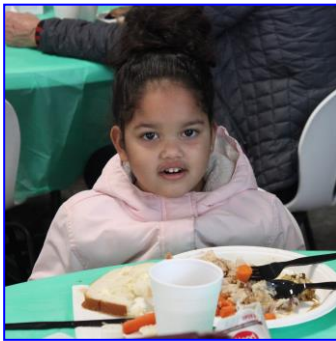
542,119 meals provided/served