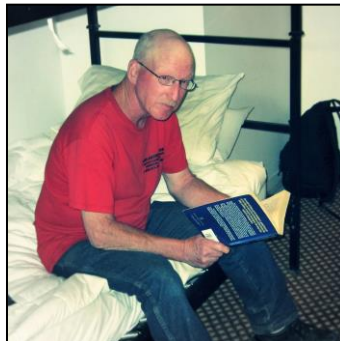
17,824 shelter beds