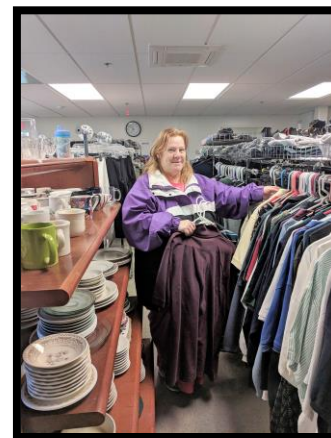
77,662 items of clothing