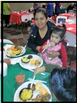
278,264 meals provided/served